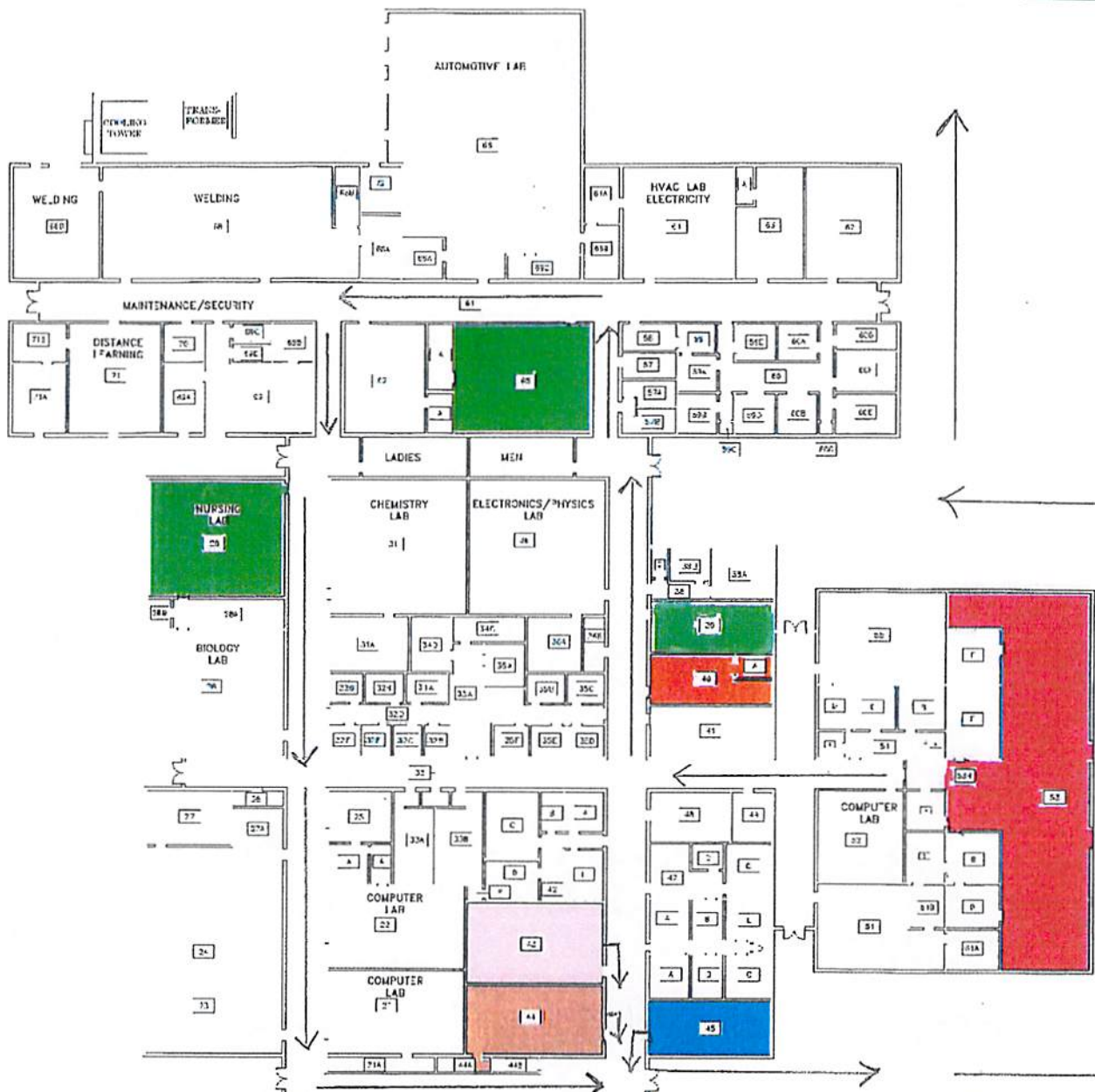
SOUTHSIDE VIRGINIA COMMUNITY COLLEGE JOHN H. DANIEL CAMPUS ADMINISTRATION BUILDING